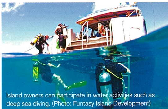
Island owners can participate in water activities such as deep sea diving.