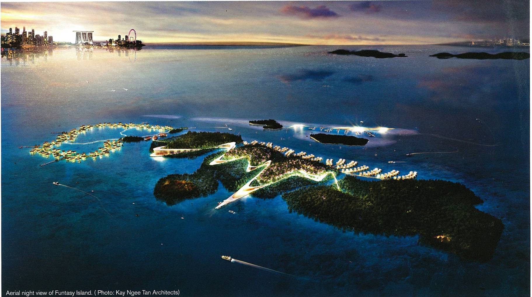
Aerial night view of Funtasy Island. ( Photo: Kay Ngee Tan Architects)

When celebrities ache to get away from the public eye, they escape to a private island they can call their own, where they will not even need to share the Wi-Fi.