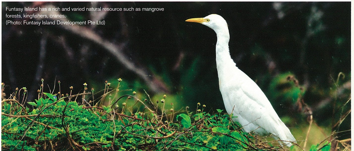
Funtasy Island has a rich and varied natural resource such as mangrove forests, kingfishers, cranes.

Cars are banned on the island and natural ventilation is employed to modulate temperatures. Tan says: "Urban dwellers shut themselves in air-con all day during work