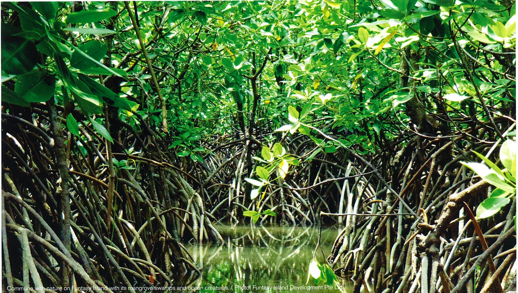
Commune with nature on Funtasy Island with its mangrove swamps and ocean creatures.